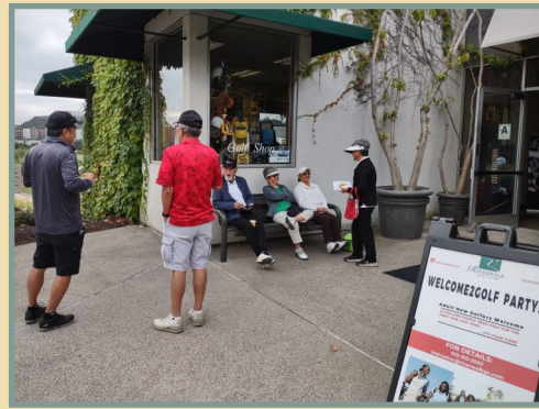
Golfers relax before heading to the course.